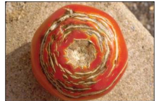
Figure 10. Concentric growth cracks.